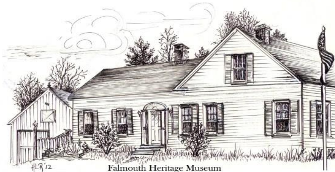
Falmouth Heritage Museum