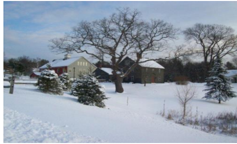
Our Offices in winter at Whipple Farm House