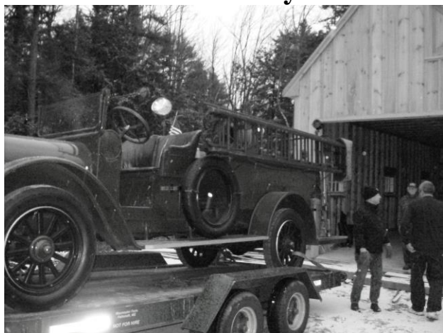
Volunteers prepare to unload The 1925 Reo fire truck